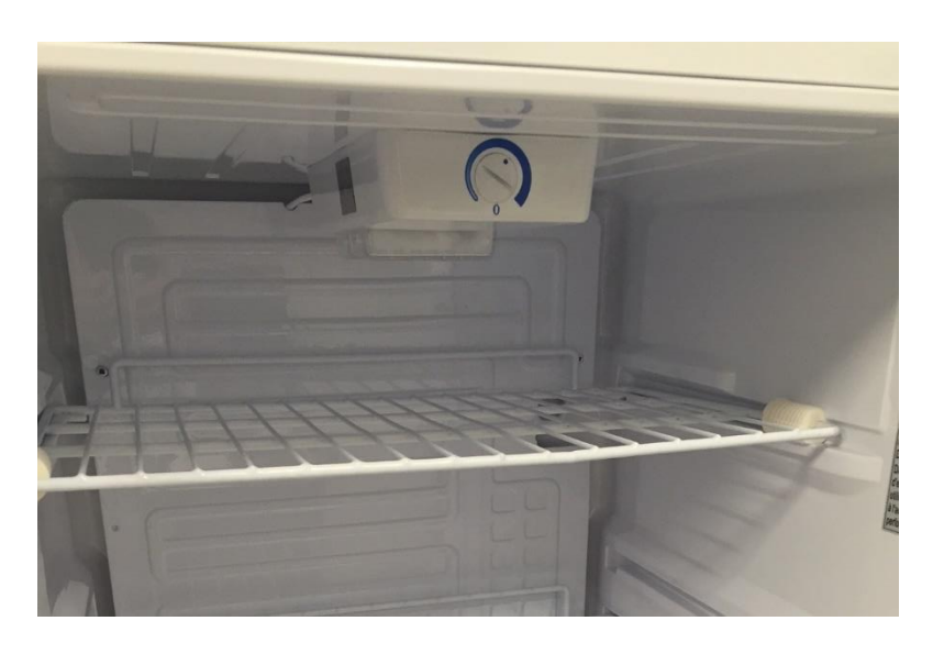
Freezer The temperature control is located outside in the rear of cabinet top left.

The temperature control is located inside the chamber top center.