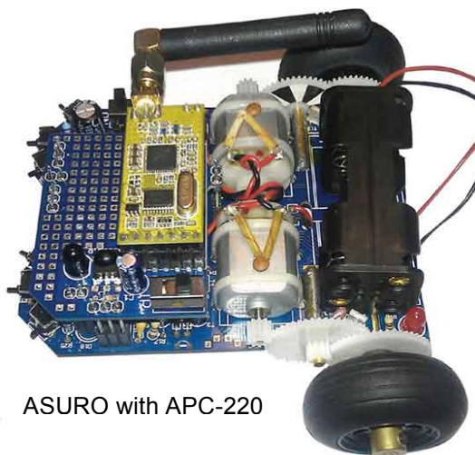
ASURO with APC-220