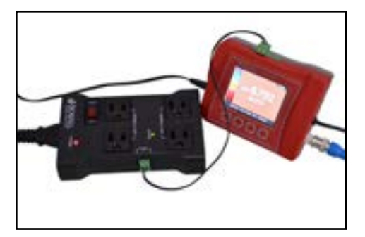
Controlling pH with the Open Source Bio™ Transmitter